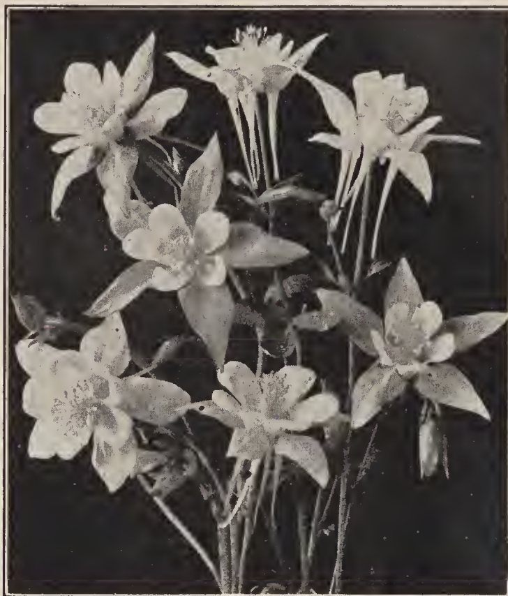
MARTIN'S LONG-SPURRED HYBRID AQUILEGIA Vigorous Plants, With a Wonderful Color Assortment

The Columbines are among the most elegant and beautiful hardy plants, producing their graceful long-spurred flowers on stems rising two feet or more above the beautifully divided foliage, and should be planted wherever their presence will serve to lighten up a too stiff and formal planting. Taken as a whole they are one of the most important parts of the hardy garden. The following varieties are all suitable for cutting and are attractive when used with other flowers.